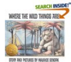
Where the Wild Things Are by Maurice Sendak