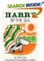
Harry By The Sea by Gene Zion