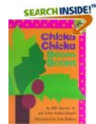
Chicka Chicka Boom Boom by Bill Martin Jr.